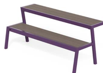
CASTEO BREAK WPC