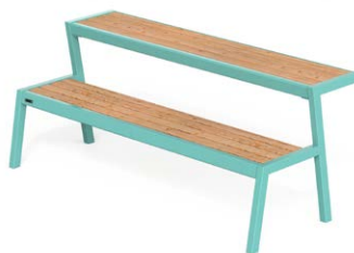
CASTEO BREAK W