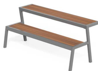
CASTEO BREAK TW