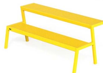
CASTEO BREAK M

Modular table with integrated seat made of 50x40x2 mm tubular steel frame and top with 4 mm thick folded steel sheet frame and 30x15x1.5 mm steel tube or 60x32 mm hardwood or thermo-treated pine slats or WPC slats.